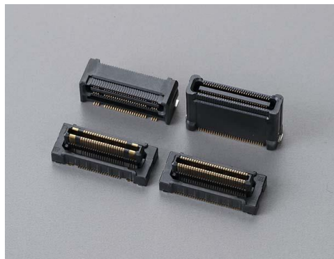
5656 Series Board-to-Board connectors

Kyoto/London – May 22 nd , 2018. Kyocera yesterday announced its new 5656 Series electronic Board-to-Board connectors, featuring 0.5 mm pitch and a proprietary floating structure that delivers the world's highest mating tolerance 1 with heat resistance up to +125°C. The new connectors appropriate for use in car navigation systems, in-vehicle infotainment and millimeter wave radar, are now available to support manufacturers worldwide.