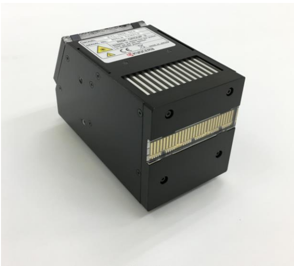
G5A Series UV-LED curing light

Kyocera's proprietary technology results in the world's highest UV intensity (24W/cm 2 ) among air-cooled curing lights for UV printing. This product sets a new industry standard by offering the highest performance in a package that is also both the world's lightest and smallest, at about half the size of a conventional air-cooled UV curing light offering high UV intensity (16W/cm 2 ).