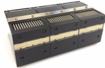
Three 80mm units connected in tandem